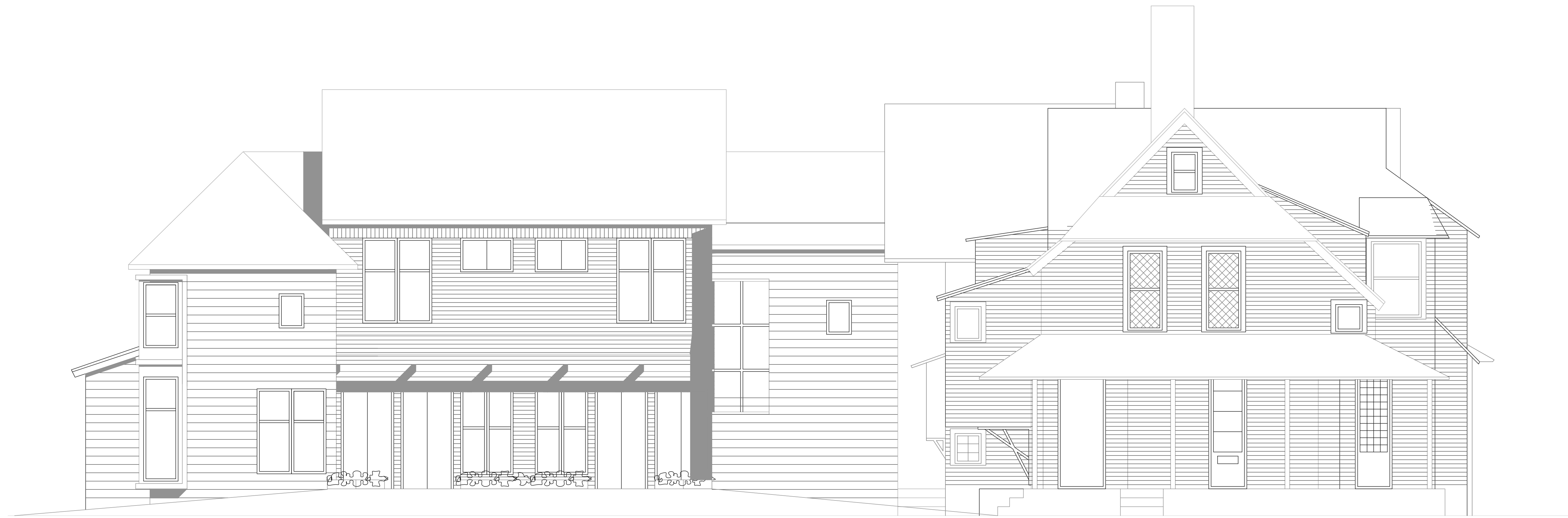
1 WEST ELEVATION A-202 SCALE: 1/4" = 1'-0"