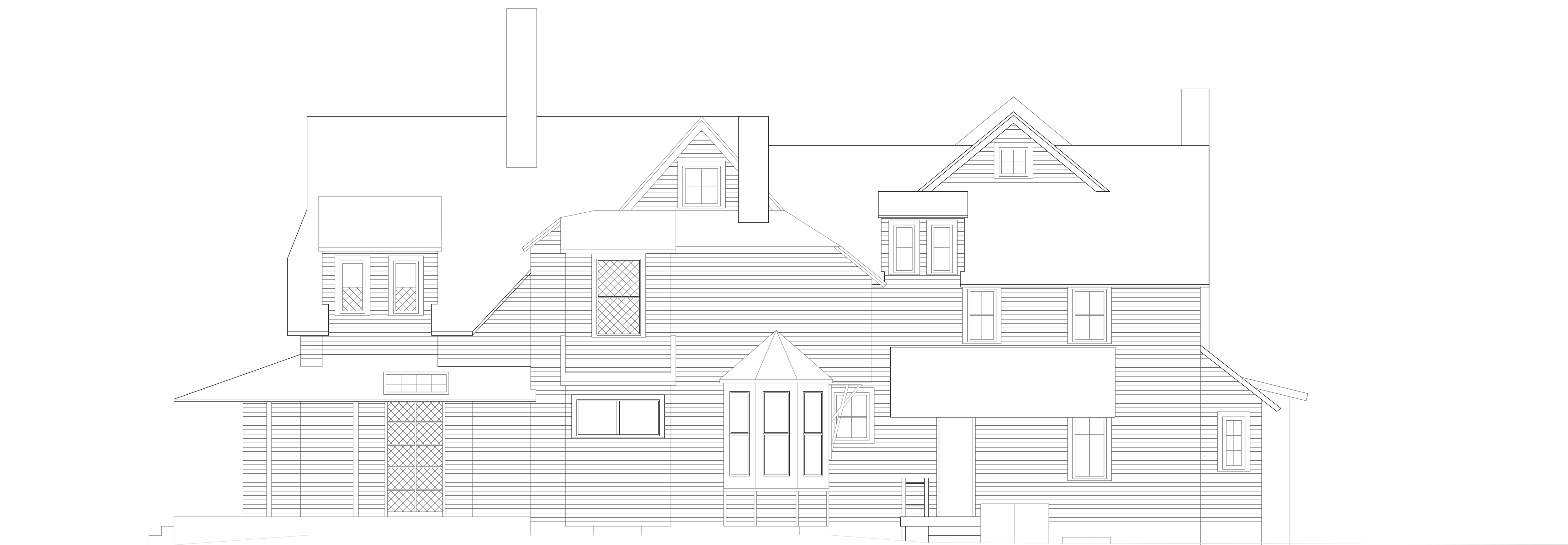
2 SOUTH ELEVATION A-202 SCALE: 1/8" = 1'-0"

KELTER & GILLIGO, P.C. consulting engineers P.O. BOX 777 14 WASHINGTON RD. PRINCETON JUNCTION NEW JERSEY 08550