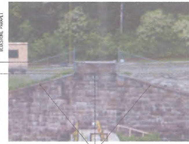
EXISTING EAST OVERLOOK PARAPET DEMOLITION