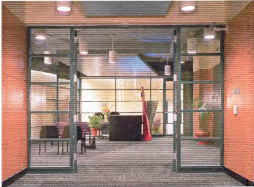
Second Floor Lobby