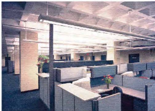
Typical Open Office

Formerly the New York Headquarters of Prudential Bache Securities, Inc., 100 Gold Street is now a New York City owned office building located in Manhattan's Financial District. Goshow Architects, in collaboration with Interior Architects, was retained by the NYC Department of Citywide Administrative Services to upgrade this 9-story, 560,000 square foot building, constructed in the 1970's, to current standards. Included in this work scope were envelope (e.g. roof, walls, windows, etc.) upgrades, mechanical, electrical, telecommunications upgrades, and selected building interiors. Illustrated here is the renovation of and interior design for the 60,000 square foot second floor for the Office of the Mayor of the City of New York. In its design, Goshow Architects has adhered to strict budgetary limits and space standards. In contrast to the Mayor's previous office spaces, which were disjointed and dark, Goshow Architects designed an open work environment that is bright and conducive to teamwork. Professional Services included: programming and full-range planning studies, comprehensive base building and interior design renovations, and HVAC and electrical upgrades.